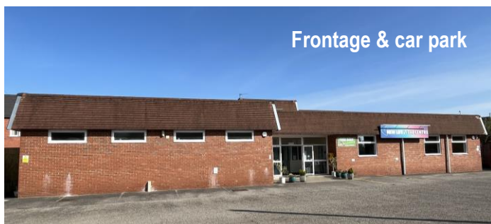
Frontage & car park