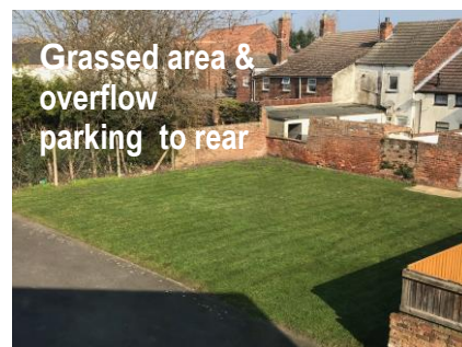
Grassed area & overflow parking to rear